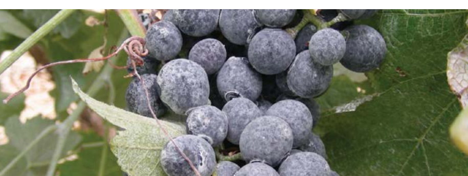
Figure 3. Grapes treated with Surround.